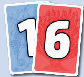
6 ROUND CARDS (1 TO 6)