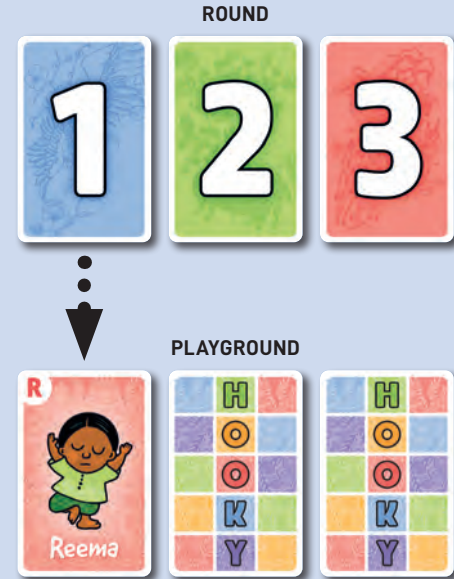
REVEAL 1 PLAYGROUND CARD AFTER THE FIRST 3 ROUNDS

After each of the first 3 rounds (rounds 1, 2, and 3), reveal a single letter card from the Playground stack. Make sure all players can see the revealed Playground cards. Now all players know this newly revealed card is not among the Hooky cards and can update their notes accordingly.