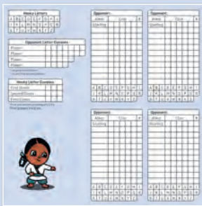
1 PAD OF PLAYER WORKSHEETS