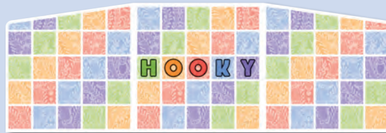
5 PLAYER SCREENS