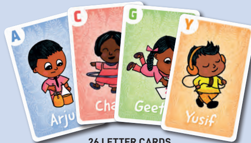
26 LETTER CARDS (A TO Z)